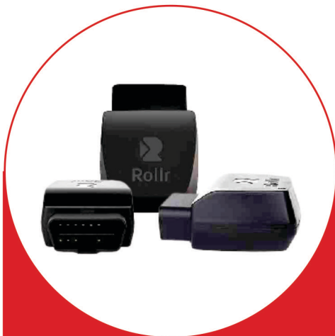
Electronics & Telematics