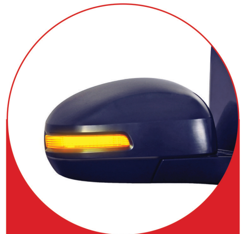
Rear View Mirrors